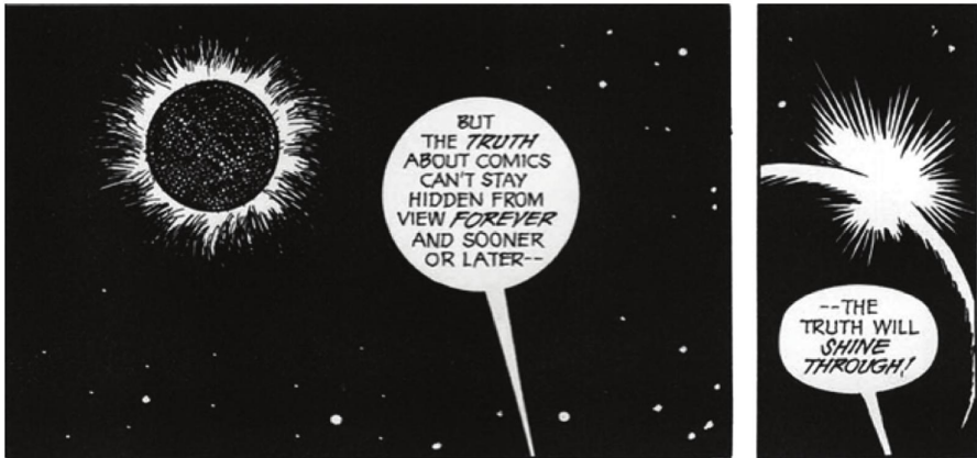
Fig. 1: The truth about comics still needs to be uncovered. Scott McCloud, Understanding Comics: The Invisible Art , New York: Harper Perennial, 1994 (1993), 211.

“The truth about comics can’t stay hidden from view forever”, argues Scott McCloud in his comic book about comic books. 1 In a way, this short quotation expresses the rich, ambivalent, and fascinating history of the medium that is the comic book. The comic book has been polarising opinions for more than 120 years: some have considered it a threat to the intellectual development of the younger generation, as venomous for the reigning moral standards in society, as cheap – and morally dubious – entertainment, as escapism, or as the reason for the demise of language. Others have praised the comic book for its creativity, for its ability to put children in touch with the pleasure of reading, or for its contemporary and innovative expression. The comic book has also been a popular medium for political, ethical and economic manipulation. 2