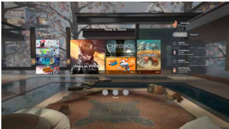
Fig.2: View inside the Oculus Lobby Hub.

The Oculus Lobby is the landing pad where virtual voyagers – cybernauts – first perceive virtuality (see fig. 2). It is the combo hub/library/store where the immersion begins. The aesthetic of this room is both indoors and outdoors: the wide world reflected in virtuality. The Lobby shows a three-dimensional environment resembling a modern-style apartment with areas for socializing, reading, and