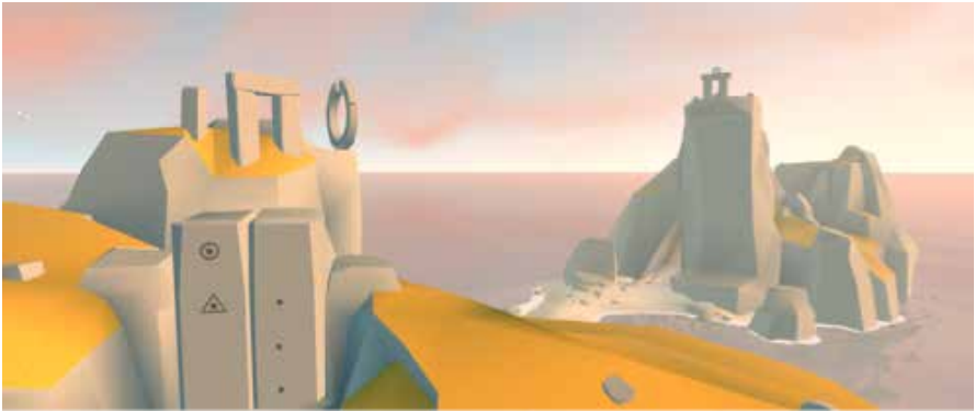
Fig. 5: Inside level 1 of Land's End.

literal here. A five-minute video review (see the private video link https://youtu.be/N6nXkTTAUUs ) provides a second-hand sense of how the game is played (see fig. 5).