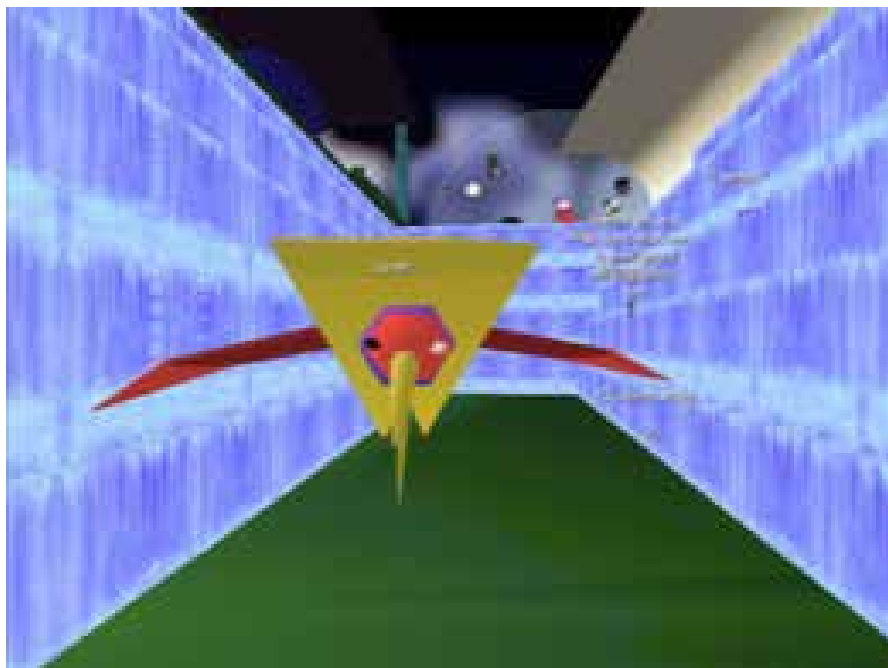
Fig. 1: Bird avatar landing on platform in low-gravity environment.

no pause to ask, What does the given world contribute? What features of the primary world appear also in the virtual? How is balance possible? What handles can be grasped inside the transition chamber that connect real and virtual? Any answer would have to take into account the fact that any definition of “real world” would be highly contentious among philosophical people. We might, for example, settle on something as abstract as geometrical figures like triangles, squares, and circles appearing in both real and virtual worlds. Computer graphics and animation, in fact, hang on the framework of geometry. But an abstract grid does not offer a range of qualitative elements to mix and balance.