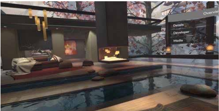
Fig. 3 The elements visible in the Oculus Lobby Hub.

When we consider the four primary elements in the Lobby, the fireplace clamors for attention (see fig. 3). The artificial alcove or hearth honors the primal element fire that doubtlessly fascinated cave dwellers in the Stone Age.