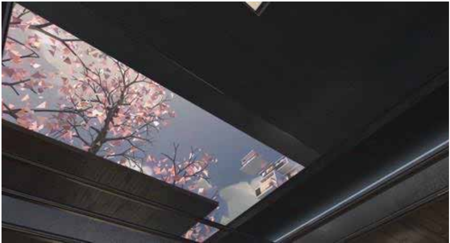
Fig. 4: Skylight view inside the Oculus Lobby.

The Lobby skylight is special (see fig. 4). Traditional architecture often celebrates public spaces, especially the entries of city halls, with a skylight. The ceiling window that funnels sky light into a gathering place is called the oculus (Latin for “eye”). The view upward through the Lobby eye shows cantilevered structures floating in clouds, contrasting with earthy branches and trees. So: earth, air, fire, water – all four elements populate the Oculus Lobby.